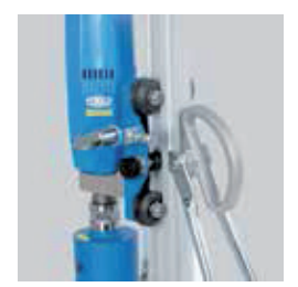
Precise operation using high quality support with stable roller guidance